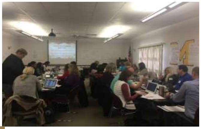
BreakOut EDU was a SUCCESS! Escape Room for the Classroom!

Training teachers and administrators in our schools to foster, coach, and support excellent teaching!