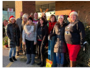
ROE #21 Williamson County Office