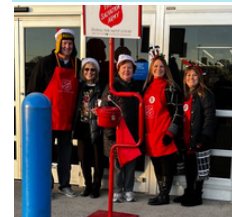
ROE #21 Franklin County Office