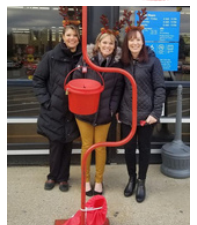
Herrin Unit #4 Staff