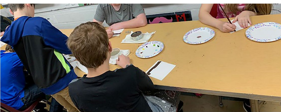
Youth Advisory Committee groups working on SAHMSA National Prevention Week projects: Preventing Prescription and Opioid Misuse (May 13) and Preventing Underage Drinking and Alcohol Misuse (May 14)